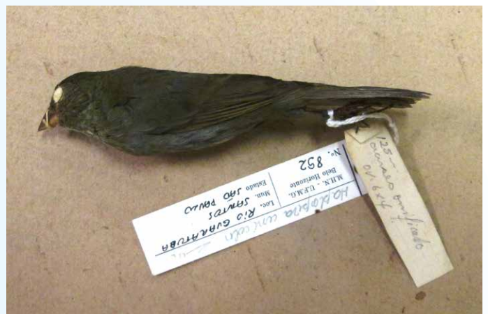
Figure 5. Specimen of Uniform Finch Haplospiza unicolor (DZUFMG-2381) collected in Rio Guaratuba.

A female (DZUFMG-2381 – Figure 5) collected on 22 June 1970 in Rio Guaratuba appears to be the first record of this species in Bertioga (Appendix). Despite found on other localities along the Serra do Mar, the Uniform Finch is usually associated to montane areas (Straube 2003, Browne 2005, Cavarzere et al. 2010, Amorin et al. 2012, Simpson et al. 2012; Mallet-Rodrigues et al. 2015). Thus, this record from Rio Guaratuba, in the lowlands, suggests that the species conducts elevational movements in the region, perhaps associated to mast-seeding bamboos (Olmos 1996, Andrade & Andrade 1997, Sick 1997, Vasconcelos et al. 2005).