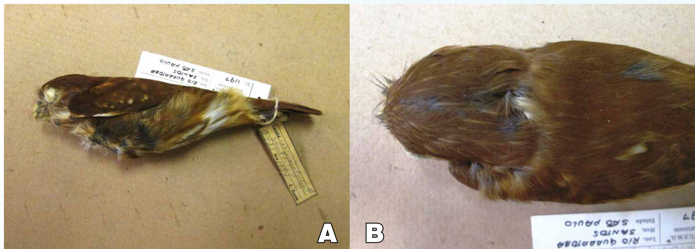
Figure 1. Specimen of Ferruginous Pygmy-Owl Glaucidium brasilianum (DZUFMG-293) collected in Rio Guaratuba: (A) lateral view; (B) diagnostic top of head with streaks.

Despite recorded in several ornithological surveys conducted in the Serra do Mar (Straube 2003, Browne 2005, Cavarzere et al. 2010, Amorin et al. 2012, Simpson et al. 2012), the only kno-