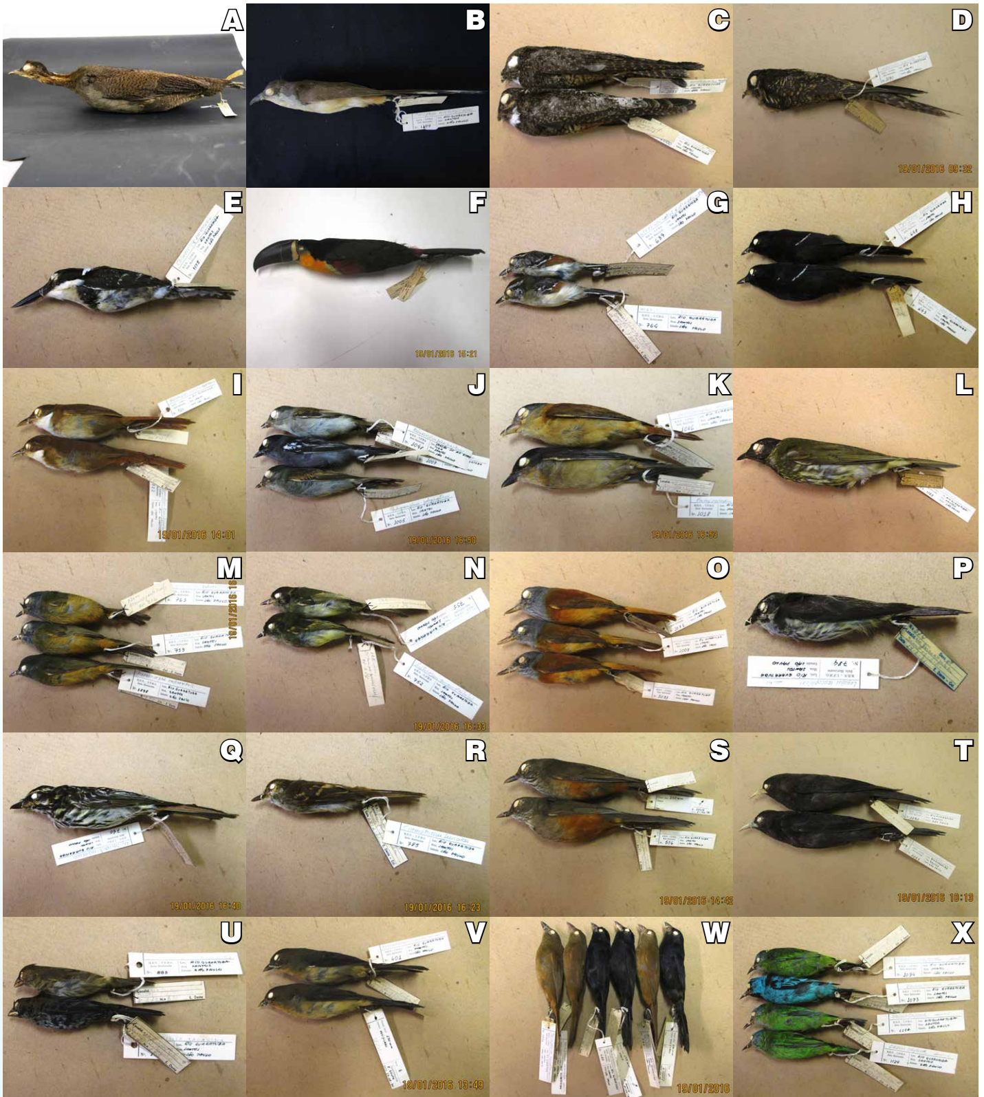
Figure 7. First referenced voucher specimens from Bertioga for the following species: (A) Solitary Tinamou Tinamus solitarius ; (B) Dark-billed Cuckoo Coccyzus melacoryphus ; (C) Short-tailed Nighthawk Lurocalis semitorquatus ; (D) Long-trained Nightjar Hydropsalis forcipata ; (E) Green Kingfisher Chloroceryle americana ; (F) Channel-billed Toucan Ramphastos vitellinus ; (G) Rufous-winged Antwren Herpsilochmus rufimarginatus ; (H) White-shouldered Fire-eye Pyrglena leucoptera ; (I) White-eyed Foliage-gleaner Automolus leucophthalmus ; (J) White-winged Becard Pachyramphus polychopterus ; (K) Crested Becard Pachyramphus validus ; (L) Bare-throated Bellbird Procnias nudicollis ; (M) Gray-hooded Flycatcher Mionectes rufiventris ; (N) Sepia-capped Flycatcher Leptopogon amaurocephalus ; (O) Gray-hooded Attila Attila rufus ; (P) Piratic Flycatcher Legatus leucophaeus ; (Q) Streaked Flycatcher Myiodynastes maculatus ; (R) Fuscous Flycatcher Cnemotriccus fuscatus ; (S) Rufous-bellied Thrush Turdus rufiventris ; (T) Red-rumped Cacique Cacicus haemorrhous ; (U) Blue-black Grassquit Volatinia jacarina ; (V) Black-goggled Tanager Trichothraupis melanops ; (W) Ruby-crowned Tanager Tachyphonus coronatus ; (X) Blue Dacnis Dacnis cayana ; (Y) Sooty Grassquit Tiaris fuliginosus .