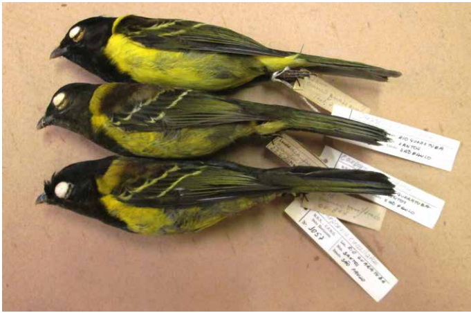
Figure 2. Specimens of Hooded Berryeater Carpornis cucullata collected in Rio Guaratuba: DZUFMG-1169, 1170, 1171.

own records of this species in Bertioga are represented by three specimens (DZUFMG-1169, 1170, 1171 – Figure 2) obtained by E. Dente in Rio Guaratuba in 1970 (see Appendix). Despite sometimes being considered a montane species (Ridgely & Tudor 1994), with records in the higher altitudes of Serra do Mar (Camargo 1946), the Hooded Berryeater reaches sea-level in the Serra da Bocaina (Mallet-Rodrigues et al. 2015). Nevertheless, since the precise locality of collection (with elevation) was not provided by the collector on the original specimens' labels, it is impossible to know if these specimens were obtained in higher elevations along the trail of Rio Guaratuba (Vagner Cavarzere 2016, pers. comm.).