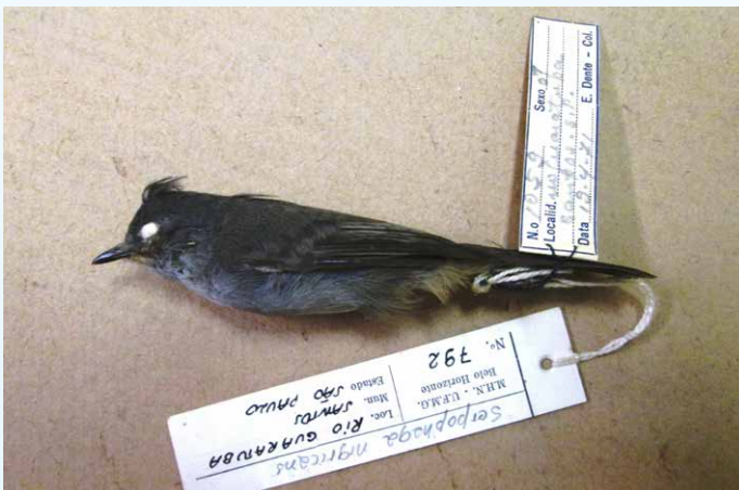
Figure 3. Specimen of Sooty Tyrannulet Serpophaga nigricans (DZUFMG-1622) collected in Rio Guaratuba.

The only municipal record for this species is a male (DZUFMG-1622 – Figure 3) taken on 19 April 1971 along Rio Guaratuba (Appendix). Despite it not being uncommon in eastern São Paulo based on records from the WikiAves platform (WikiAves 2016), the species has not been found in the lowlands of Serra do Mar (Straube 2003, Browne 2005, Simpson et al. 2012, Amorin et al. 2012, Mallet-Rodrigues et al. 2015), but it is also possible that it has been collected at higher elevations along the main trail of Rio Guaratuba (Vagner Cavarzere 2016, pers. comm.).