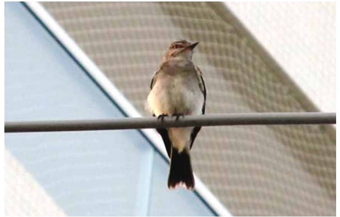
Figure 4. Gray Monjita Xolmis cinereus photographed on 7 January 2016 at Praia da Enseada.

Between 3 and 8 January 2016, MFV observed and photographed a single individual of Gray Monjita at Praia da Enseada